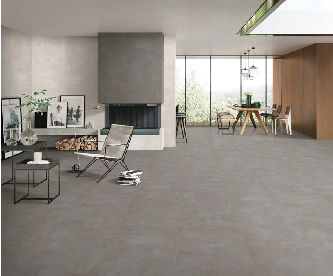
Ash - grande